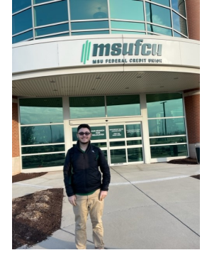
suggested connecting with Project SEARCH. It has been an honor to work with such a great organization and the wonderful students in the program."